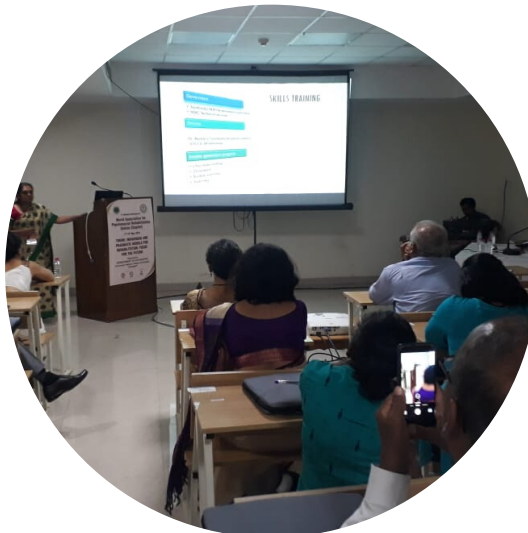
"World Association of Psychosocial Rehabilitation" (Chapter 6) held at GMCH Chandigarh