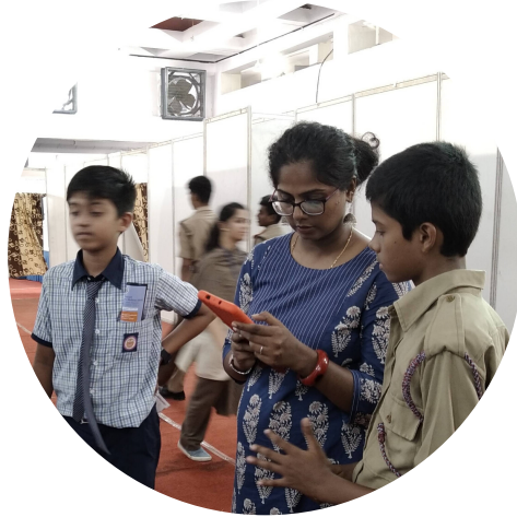
Mental Health Screening