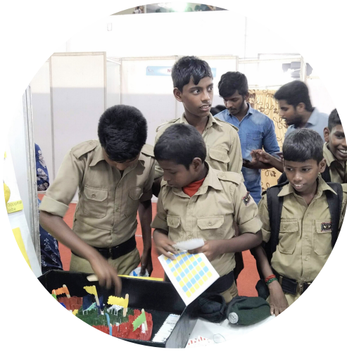
Mind games for students